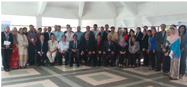
All of the participants of Synthesis Workshop of STAR and SHARP