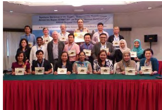
All the project partners of the five UNESCO STAR and SHARP demonstration sites with Prof Shahbaz Khan and UNESCO Office Jakarta

In summary, 45 participants from ten countries exchanged and discussed pathways to implement sustainability science approach through: