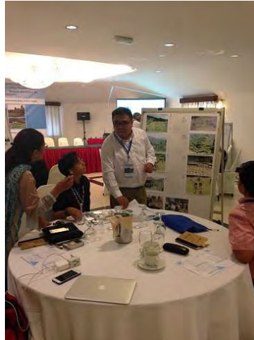
Project partners and stakeholders of Ifugao elaborated on photostory.