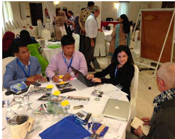
Project partners and stakeholders from Siem Reap and Tonle Sap discussed photos for the photostory