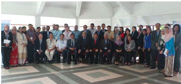
All of the participants of Synthesis Workshop of STAR and SHARP